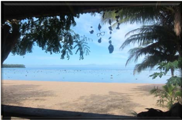
The new "beach" in front of the bungalow. Love the mobile!!