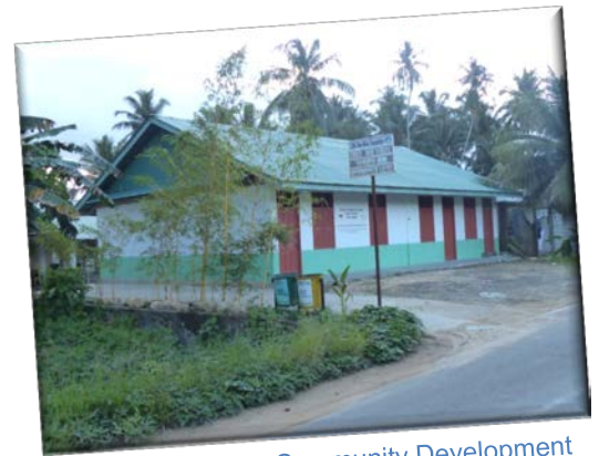
The new Ono Niha Community Development Centre

Scholarships: This program is going well, with 21 students supported by sponsors in Australia. The finances are in good shape and the procedures are working well. We met all the students and families and they were very thankful for the support. Additional donations paid for care packages (a large bucket, rice, noodles, eggs, toothbrushes, medicines and a bath towel) for each family,