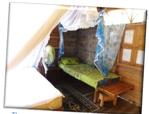
The renovated bungalow with two beds