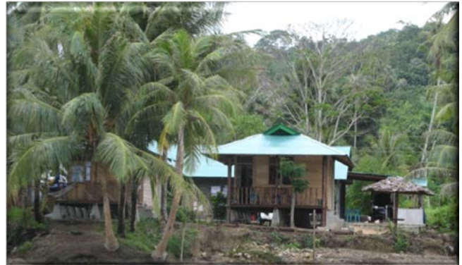
The bungalows – before the beach